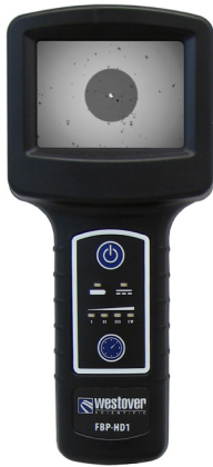
HD1 Handheld Display with 3.5-in LCD