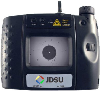
HD2-P4-V Handheld Display with 3.5-in LCD

Rugged, Versatile Handheld Display with 3.5-inch TFT LCD